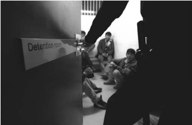
12. Asylum-seekers who arrived in the UK aboard a freight train being detained in a holding cell in Folkestone

The situation of rejected asylum-seekers remaining in the destination country despite having had their applications and