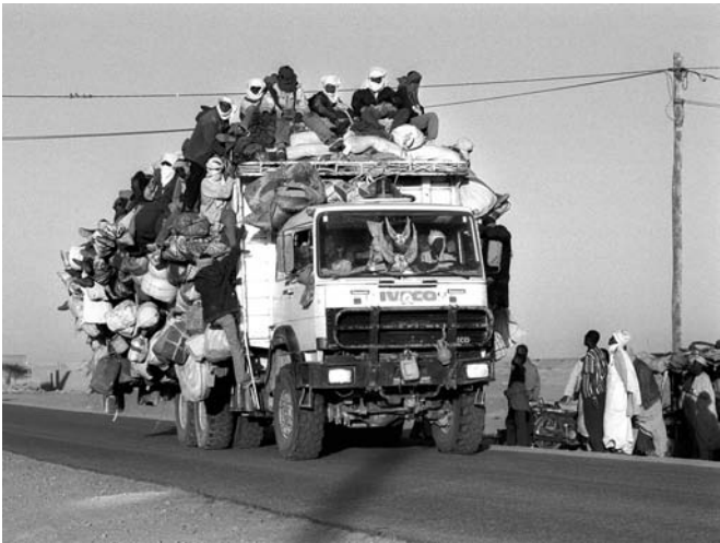
2. A truck loaded with migrants leaving Agadez in Niger and bound for North Africa

Furthermore, the traditional pattern of migrating once then returning home seems to be phasing out. An increasing number of