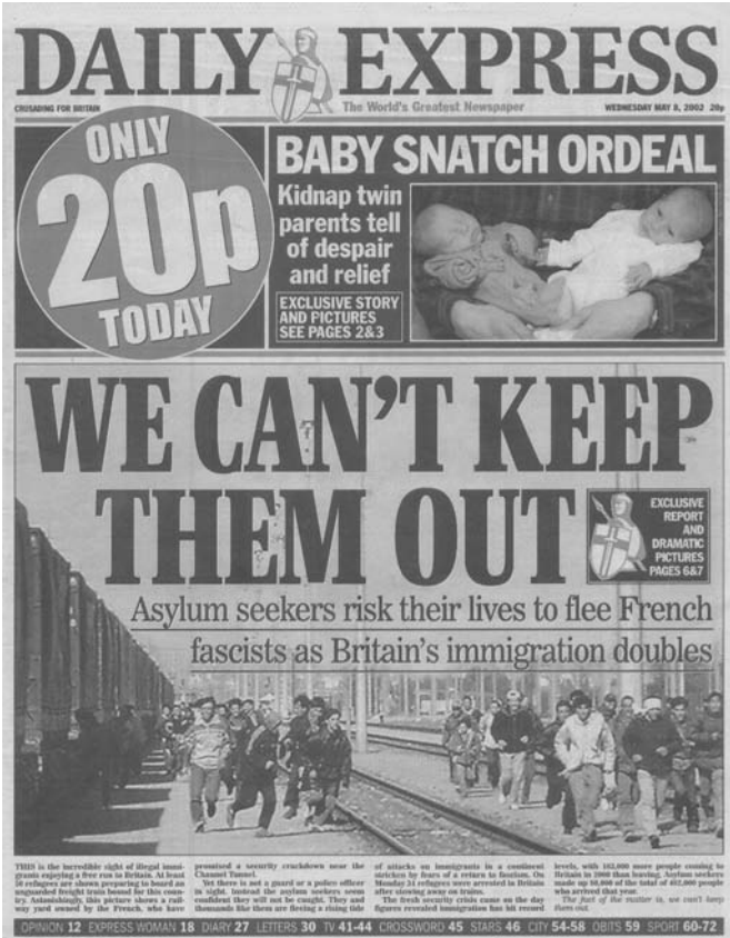
10. An alarmist Daily Express front page from 2002