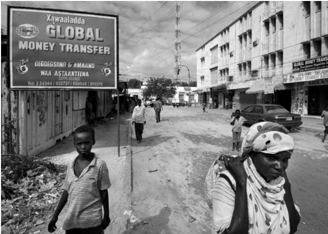
5. Billboard advertising an international money transfer company in Mogadishu, Somalia

These data problems notwithstanding, the World Bank produces annual estimates of the scale of remittances worldwide. They estimate that in 2004 some US$150 billion was sent home by migrants, and forecasts indicate that the figure was closer to US$200 billion in 2005. These are quite staggering sums. They are also striking because they represent a 50 per cent increase in the flow of remittances in just five years – the main reason being the impact of globalization. According to some analysts, in terms of