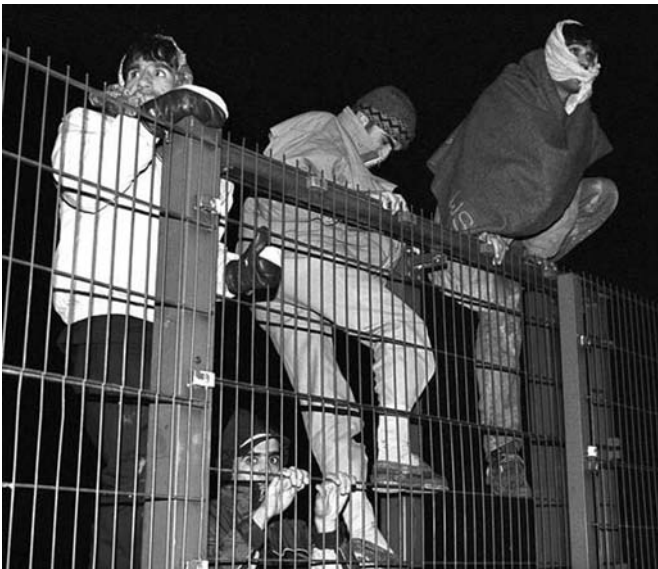
7. Migrants climbing over a fence in Frethun in Northern France to board a freight train bound for the Channel Tunnel and the UK

It is clear, then, that irregular migration can threaten state security, although the relationship is complex. Equally, however, irregular migration can undermine the human security of the migrants themselves. The negative consequences of irregular migration for migrants are often underestimated. It can endanger their lives. A large number of people die each year trying to cross land and sea borders without being detected by the authorities. It has been estimated, for example, that as many as 2,000 migrants die each year trying to cross the Mediterranean from Africa to Europe, and that about 400 Mexicans die trying to cross the border into the USA each year. And one of the great unknowns of international