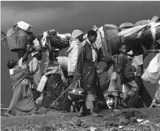
8. Rwandan refugees on the move

Although this is not the place to review the extensive literature on modern warfare, it is worth listing the characteristics that the