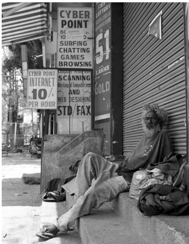
4. Homeless man sitting next to an internet café in Bangalore, India

made or received a phone call', although this statistic has been widely debated ever since. Bridging the digital divide is nevertheless considered important for achieving global equality, increasing social mobility, encouraging democracy, and promoting economic growth.